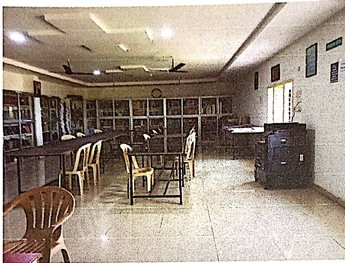
SCANNER WITH PRINTER