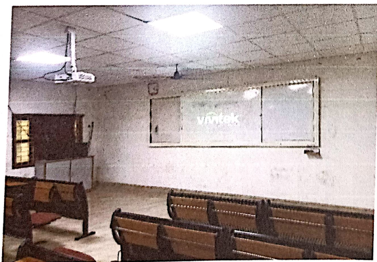
SEMINAR hall with projector

[Signature] PRINCIPAL Lenora Institute of Dental Sciences RAJANAGARAM